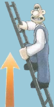
the ladder again